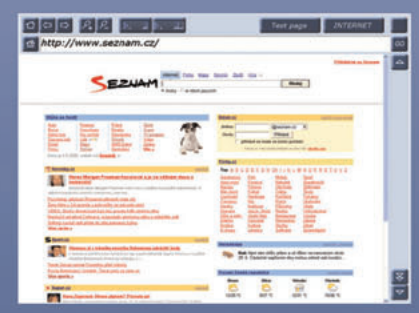
POWER products continues to develop and support it's own XBrowser software solution for kiosk internet browsing, intranet and other individual kiosk applications.