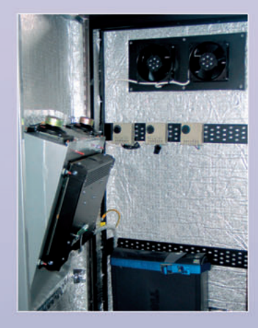
Demonstration of the Climate Control Unit in the outdoor Hawk

Other specification: see Hawk (on the left page).