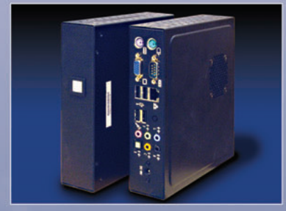
Industrial computer MSI. Suitable for difficult outdoor applications. Intel Mobile processor. 1 GB RAM. 80 GB HD. Size: 180(H) x 43(B) x 180(T) mm.