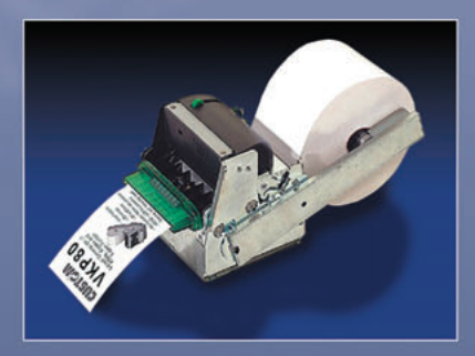
Thermal Printer VKP 80 II. Paper width: 60 - 82,5 mm. Printing speed: 220 mm/sec. Autocutter and fully motorised paper handling. RS232 and USB interface or Ethernet.