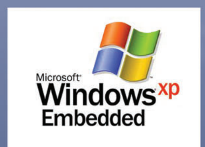
Since Jan. 1, 2009 POWER products is a Microsoft Windows XP Embedded Partner. We continue to deliver the ideal Windows XP OS configurations for all kinds of kiosk applications.