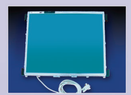
19" LCD TFT chassis. Resolution: 1280 x 1024. Brightness 270 cd/m2. Contrast 550:1. Analog input. Touchscreen optional.