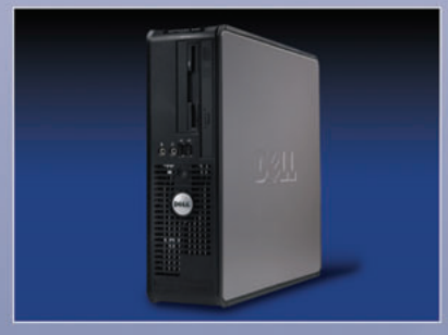
DELL Optiplex 760 Small Factor Custom Configuration Warranty 3 Years Next Business Day