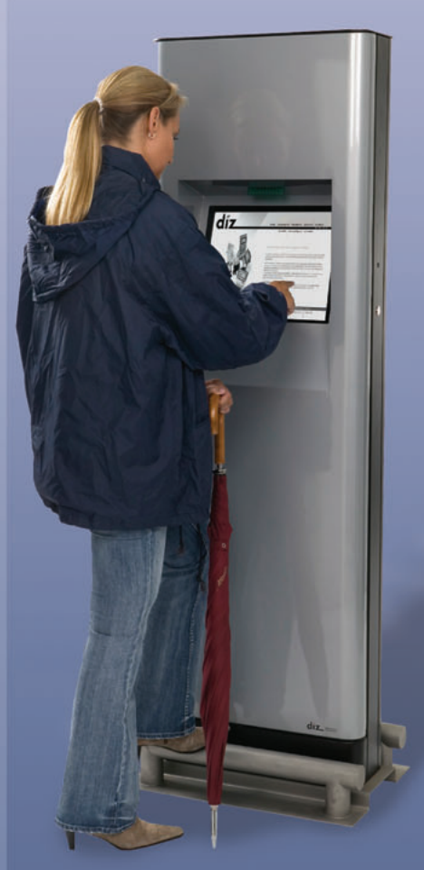
Hawk with stainless steel pedistal