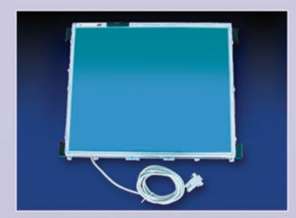
17" LCD TFT chassis. Resolution: 1280 x 1024. Brightness 250 or 1500 cd/m2 optional. Contrast 450:1. Analog input. Touchscreen optional.