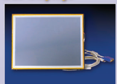
15" LCD TFT chassis. Resolution: 1024 x 768. Brightness 250 or 1500 cd/m2 optional. Contrast 400:1. Analog input. Touchscreen optional.