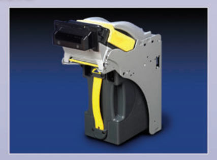
Banknote Acceptor MEI SC. Top model of the banknote acceptors. Lockable safe for 600, 900 or 1200 banknotes. RS232 or USB.