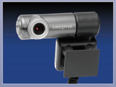
Web camera. VGA resolution 640 x 480. 60 frames per second. Windows drivers. USB interface.