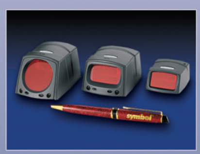
MiniScan Series Bar Code Readers. 640 Scans per second. Laser, Smart raster pattern. RS232 or USB interface