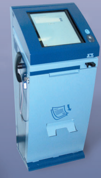
EVA - Electronic, Friendly Administration

The Eva Kiosk enables the general public to have remote access to local government information whilst also completing and submitting certain documents such as new ID and other official forms via simple, user friendly programs.