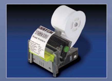
Thermal Printer TG 2460 II. Paper width: 60 mm. Printing speed: 120 mm/sec. Autocutter and static presenter. Anti paper-jam. USB interface.