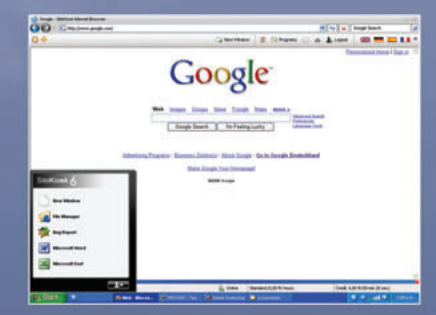
POWER products distributes and supports one of the most popular kiosk software application packs - PROVISIO SiteKiosk.