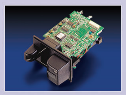
Manual Hybrid Card Reader ICM330. Smart and Magnetic Card Reader, Manual insertion, Anti-Intrusion shutter, EMV Approval, RS232 or USB interface.