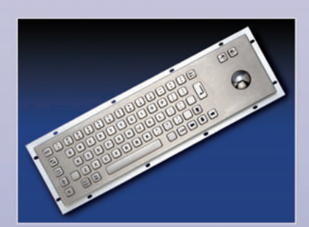
Metal Keyboard with Trackball Internet Layout. National Layouts available. PS2 or USB Interface.