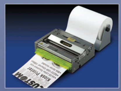
Thermal Printer KPM 210/216H. Paper width: 210 or 216 mm. Printing speed: 125 mm/sec. Autocutter and fully motorised paper handling. RS232 and USB interface or Ethernet.