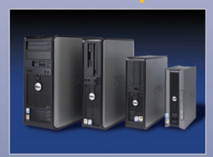
Complete range of DELL Desktop Computers offer you high performance, reliability and full configuration flexi-bility. 3 Years Warranty - Next Business Day gives you unprecedented support.