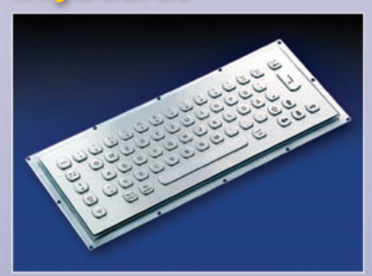
Metal Keyboard without Trackball Internet Layout. National Layouts available. PS2 or USB Interface.