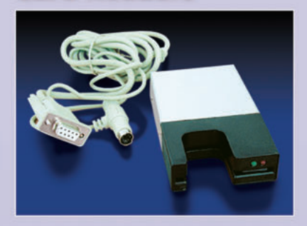
Manual Hybrid Card Reader SCR28. Smart, Memory and Magnetic Card Reader, Manual insertion Drivers and libraries for Windows, CE, Linux. RS232 or USB interface.