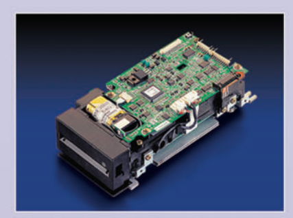
Motorised Hybrid Card Reader ICM330. Smart and Magnetic Card Reader, 1 SAM socket on board. Anti-Intrusion shutter. EMV Approval. RS232 or USB interface.